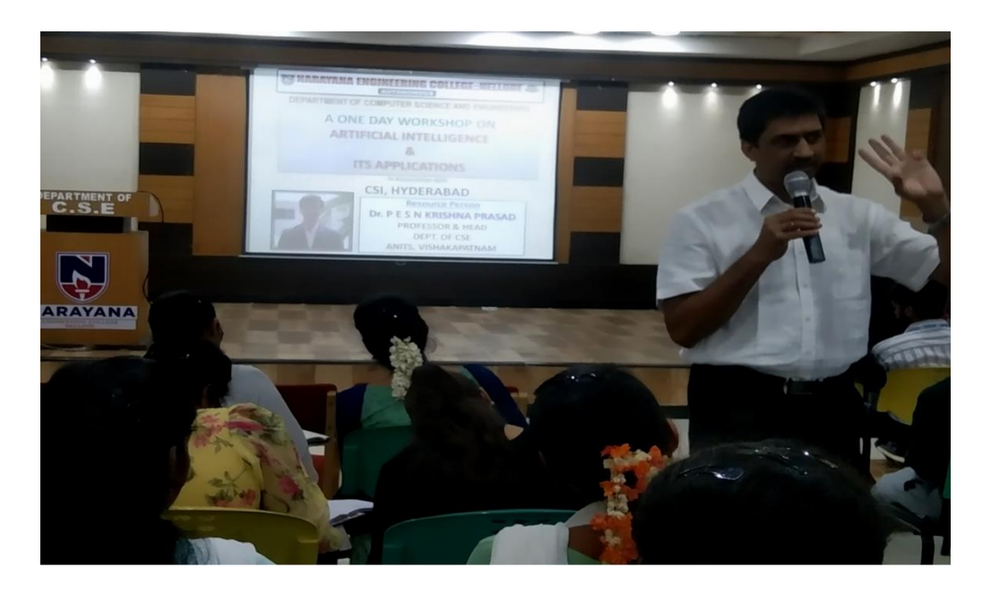
Resource Person initiation to the audience

Artificial intelligence (AI) is the intelligence of machines or software, as opposed to the intelligence of human beings or animals