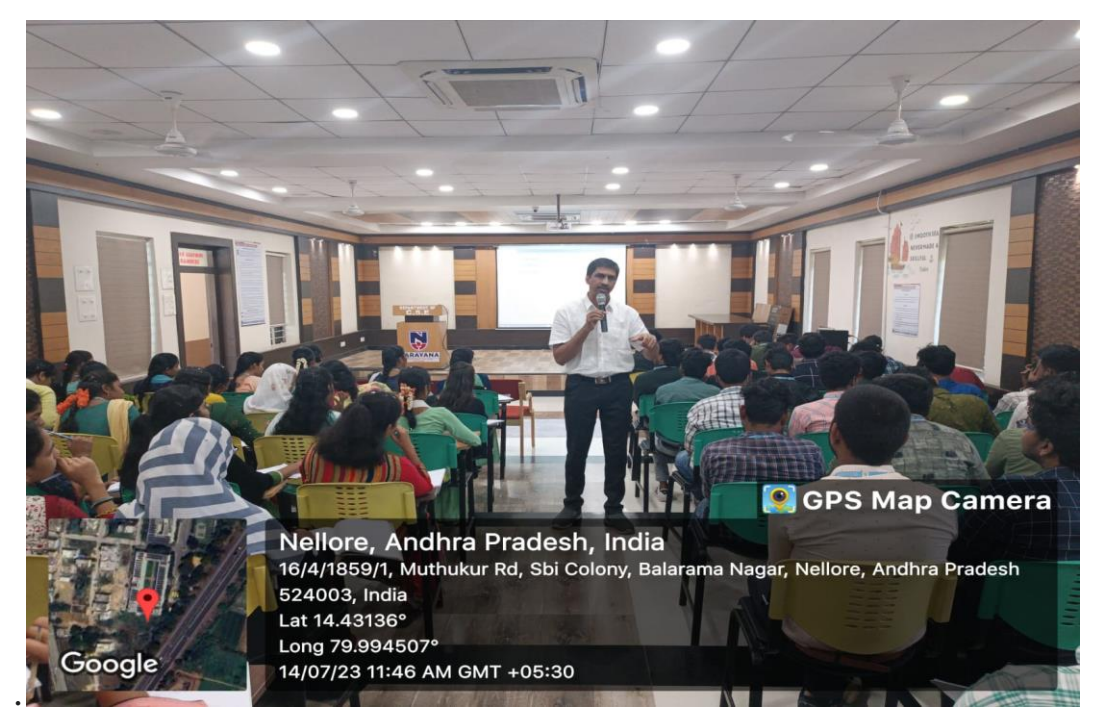
Resource Person delivering Key concepts